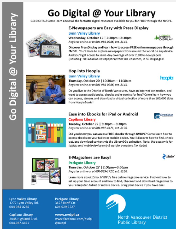
Go Digital promotional poster.

In celebration of Library Month, NVDPL hosted five programs to encourage digital literacy and learning—as well as promote the digital resources and services available to patrons. We held an “E-Newspapers are Easy” session, “Hop into Hoopla” workshop, “Ease into Ebooks” class, and a “E-Magazines are Easy” session—all facilitated by in-house staff. We also hosted One on One Technology Training with our local teen volunteers.