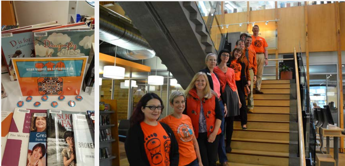
Resource displays at Capilano (left) and Lynn Valley staff decked out in orange (right).

The Library celebrated Orange Shirt Day on September 30 by putting out information displays and resources highlighting materials on the history of residential schools, First Nations authors, histories and reconciliation. We also dressed up in ORANGE to show our support. To learn more about Orange Shirt Day, visit http://www.orangeshirtday.org/