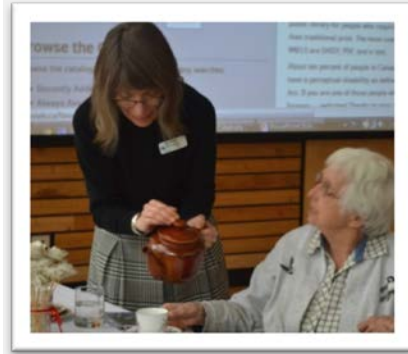
Serving tea at our White Cane Week celebration event.

White Cane Week is an annual event sponsored by the Canadian Council for the Blind that raises awareness for issues that confront the blind and vision impaired community. In honour of the week, NVDPL held a celebratory tea and presentation on library services for people with print disabilities on February 2. Event attendees learned about the National Network of Equitable Library Service (NNELS) collection of digital audiobooks, the NVDPL Talking Books fiction and non-fiction collection, the range of materials available in the NVDPL digital library and NVDPL's Home Library Service. It was a sociable afternoon on a miserable, rainy day, with library staff and Talking Books patrons enjoying tea and conversation after questions. Library staff was also out and about in the community on February 4, promoting our services for patrons with print disabilities at Park Royal Mall.