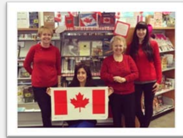
Library photo shared for the "Share Your Moment with the Flag" campaign.

On February 15, Canada celebrated the 50th anniversary of the Canadian Flag. In honour of the occasion, we put displays up in each of our branches and participated in the "Share Your Moment with the Flag" social media campaign. This is a campaign where participants post photos of themselves with the Canada flag, using the hashtag #flag50.