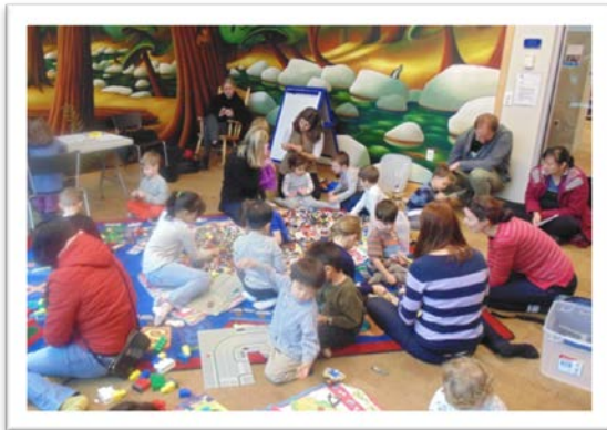
Lego party at Lynn Valley Library on Family Day.

Family Day took place Monday, February 9. While all three NVDPL locations normally close for stat holidays, this year we did something different for Family Day: Lynn Valley Library remained open from noon to 5pm, while Capilano and Parkgate Libraries closed.