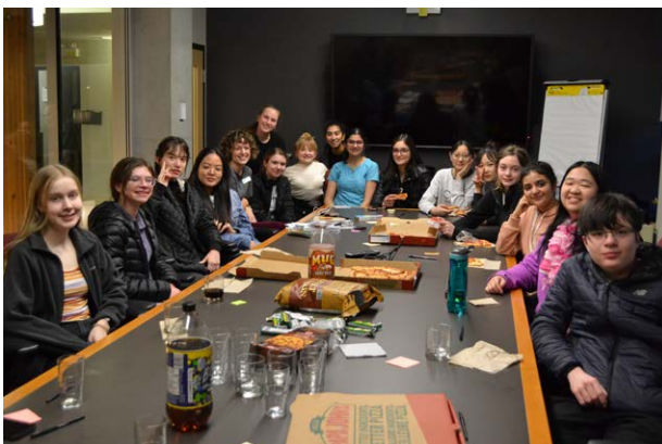
The TAG team at Lynn Valley!

In addition to TAG, there are lots of other fun things happening with youth at the library, including two Teen Advanced Reader Copy Book Clubs, a monthly Teen Writer's Group for aspiring novelist and poets, and Spill the Tea, a weekly drop-in program with Youth Outreach Workers from the North Shore Neighborhood House. Six to eight teens also volunteer 8 hours per month as Book Buddies and Tech Tutors. All three NVDPL branches enjoy the participation of vibrant teens reading, writing, and working hard to help us improve NVDPL services for teens, as well as their communities.