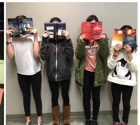
Advance Readers unite!