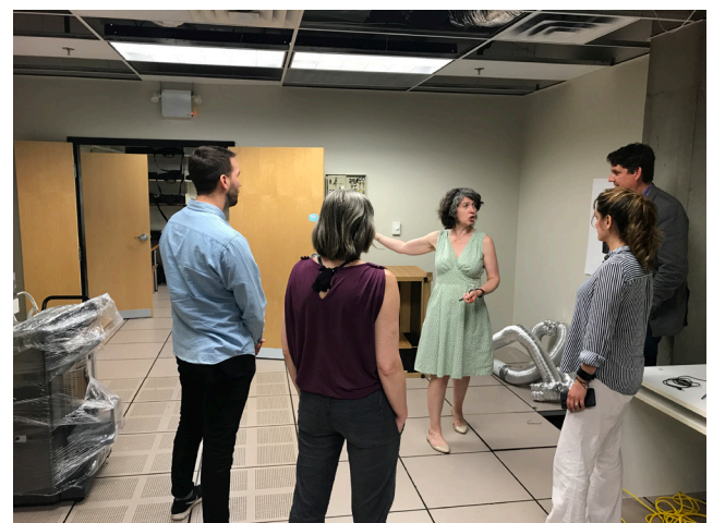
Staff from North Van Arts and Zen Maker Labs get a tour through the future home of StoryLab.