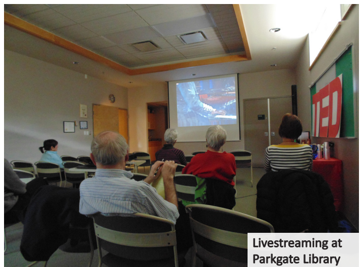
Livestreaming at Parkgate Library