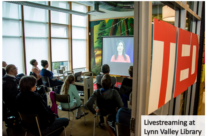
Livestreaming at Lynn Valley Library

There was also one couple who went to the TED talks at all three NVDPL branches, and they were very grateful we were showing them! Overall, the TED livestreaming was a great success at NVDPL!